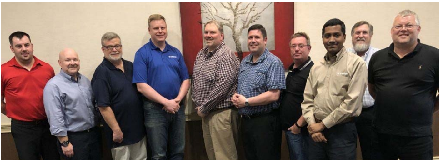
Group shot of ISA112 SCADA Systems Standards Committee Members who met on May 17, 2019 for a full day workshop to iron out table of contents details and key terminology for the standard's main document.