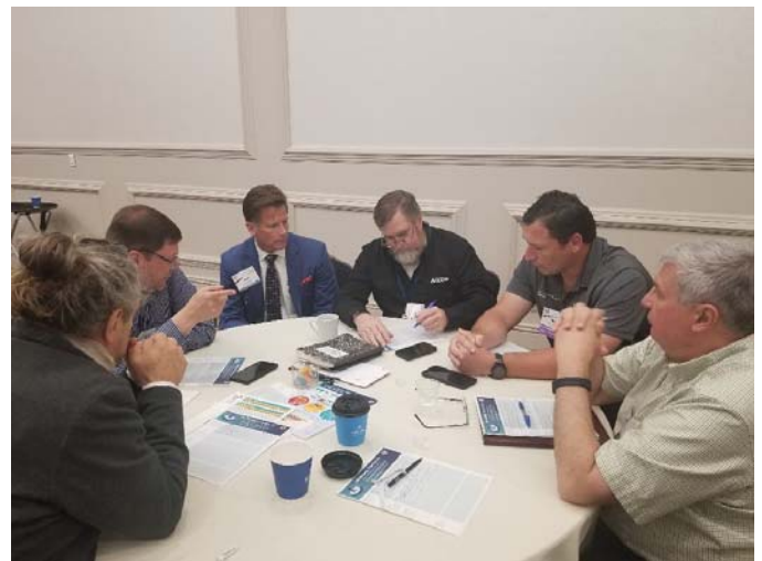
Throughout the weekend, ISA leaders and staff worked together on a wide variety of society initiatives.