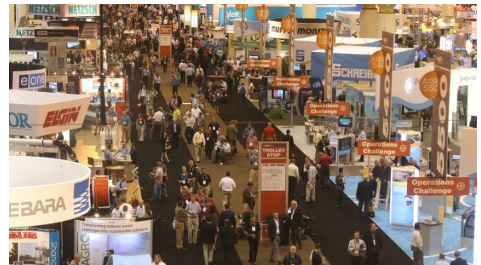
Photo of the 2019 WEFTEC Exhibitors Floor in Chicago, Illinois, USA. Each year, the annual WEFTEC conference welcomes over 1,200 exhibitors and 23,000 attendees.

Presented by the Water Environment Federation (WEF), the Water Environment Federation’s Technical Exhibition and Conference (WEFTEC), is the largest conference of its kind in North America and offers water quality professionals from around the world with the best water quality education and training available today.