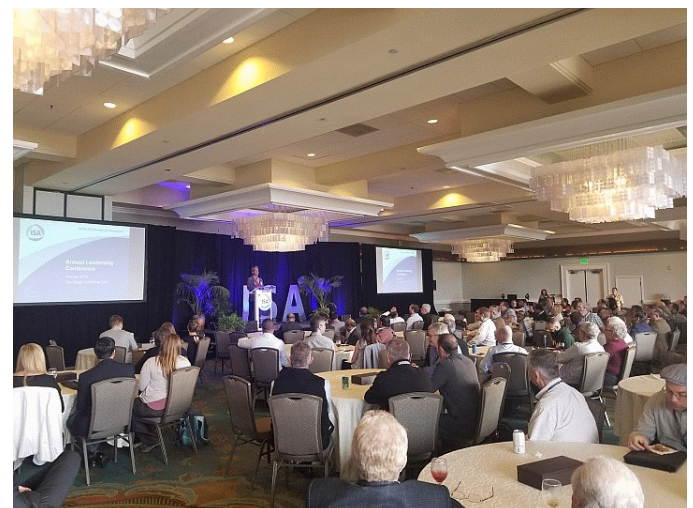
Photo from opening session of the 2019 ISA Annual Leadership Conference in San Diego, California, USA

The conference also provided a chance for ISA's many volunteer leaders to reconnect with old friends and reach out to new folks who are just getting started with the ISA. The WWID looks forward to a bright year ahead!