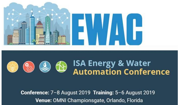
Logo from the 2019 ISA Energy & Water Automation Conference, recently held in Orlando, Florida USA