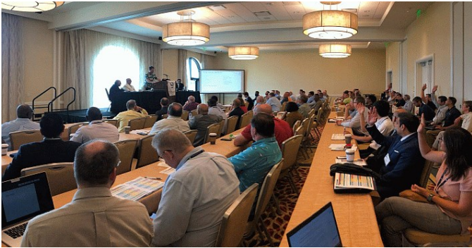
We had a full house in the presentation room.