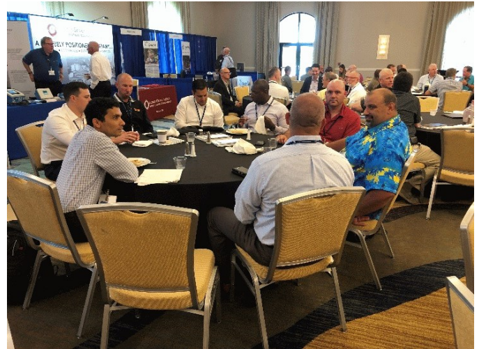
The event featured fully catered lunches for all, and a chance to talk to our many sponsors and vendors.