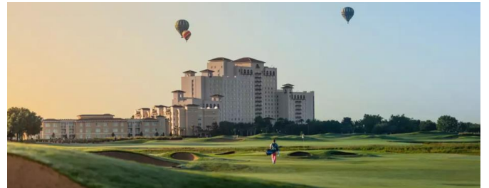
A photo of the conference hotel: The OMNI Championsgate Resort hotel in Orlando, Florida, USA.